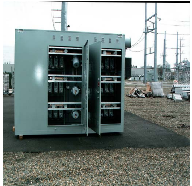
Scott Engineering, Inc

For any custom requirements, please contact Scott Engineering or your local Scott Engineering Representative